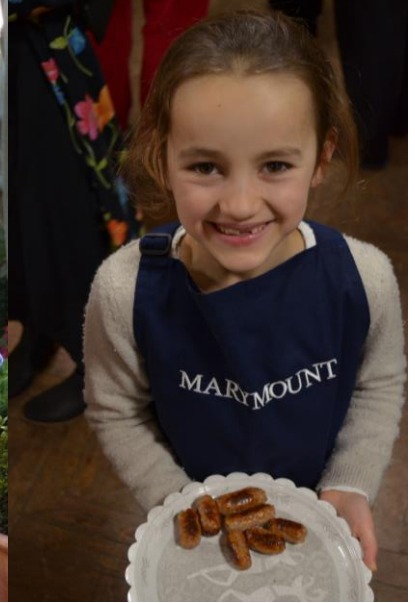
Summer Party 2019 Garden of Elm Lodge, 7.30pm, 8 th June